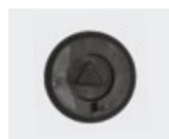
Triangular screw 11 mm