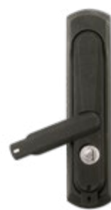
Triangular 11 mm