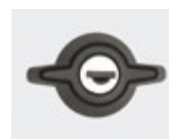
Manual with key lock