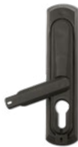
Without Cylinder & key