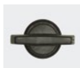
Double bit lock 3,0 mm (standard)

*Transform the number before the last one of reference to choose the type of locking device.