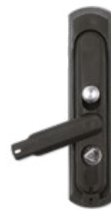
Triangular 11 mm + padlocking handle