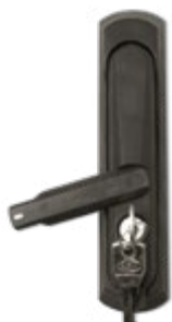
Cylinder & key locked