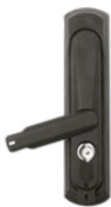
Double bit lock

Various locks & keys possible (example : 455/405/1242E/421...)